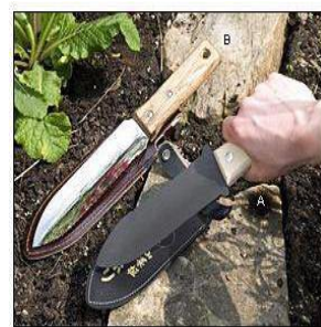
`Hori Japanese Knife