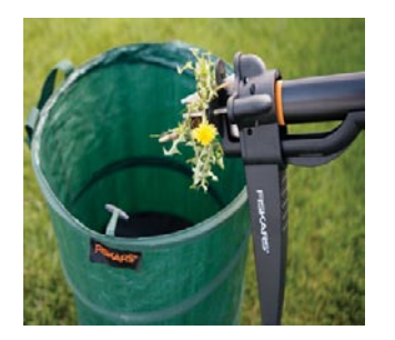
Tips & Tricks by Anna Leggatt

Full details on all our photography contests can be found in your yearbook on pages 28 to 30, and on our website at <a href="www.eygc.ca/photocontest">www.eygc.ca/photocontest</a>.