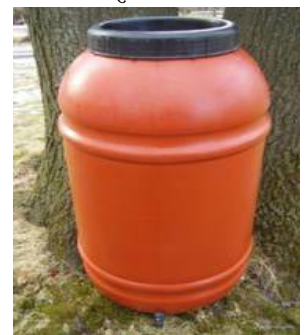
190 Litre Rainbarrel