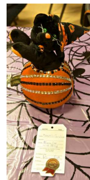
HM: Karen Bell "Black Cat with Bling"