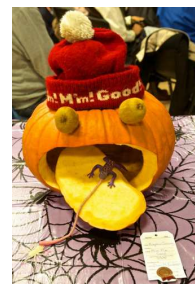
HM: Dawn McEachern "M'm M'm Good"