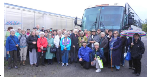
Tour Group ~ 2015