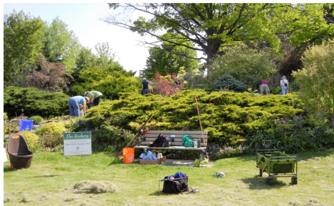
Hard work at the kick-off

If you have never seen the Rockery, or haven't been there in a while, why not walk by sometime and see the effect a hardworking group of volunteers can have on a rocky piece of City of Toronto property.