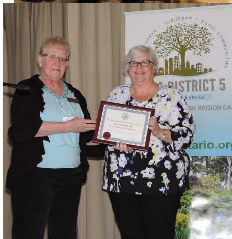
Our 90th certificate from OHA rep