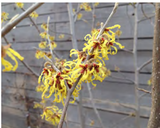
Witchhazel often blooms before the snow has gone.

SATURDAY, FEBRUARY 18, 2017 from 10am to 4pm