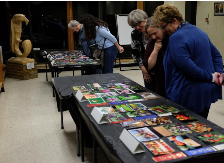
Checking Out the Photos Entered in the Fall Photo Contest